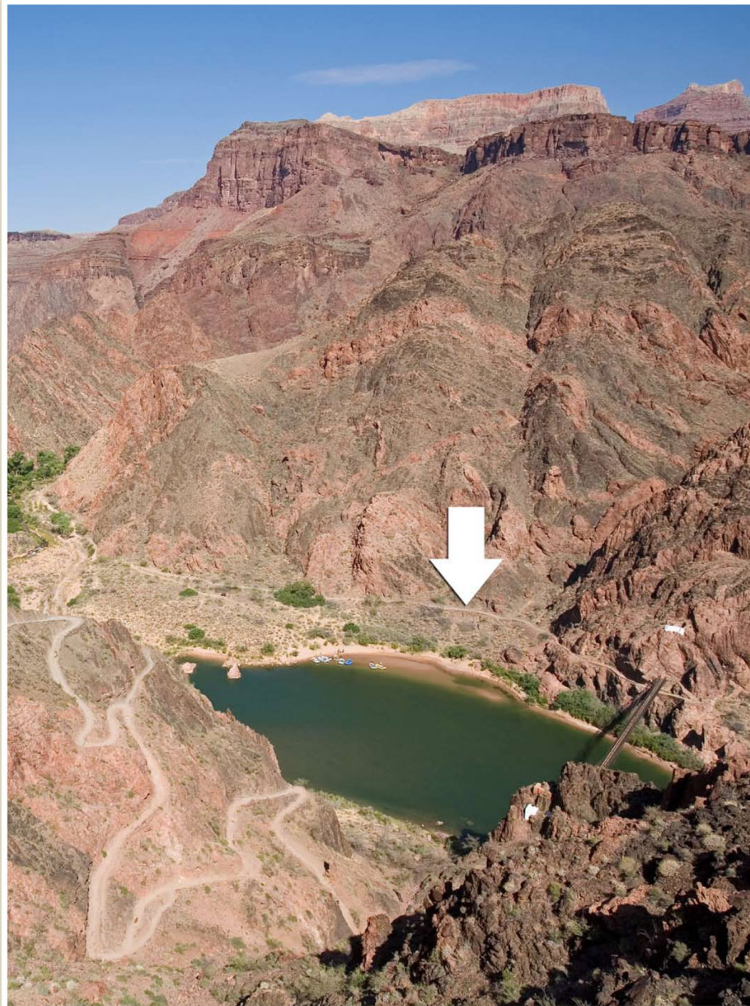
Above: Bright Angel Pueblo (as seen from the South Kaibab Trail) was one in a network of thriving communities canyonwide.